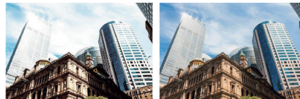
For illustration purpose only